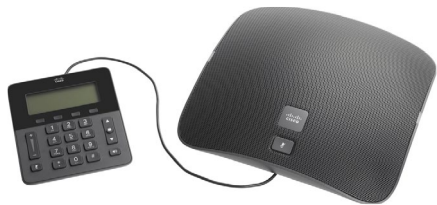
Cisco Unified IP Conference Phone 8831