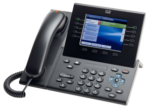
Cisco Unified IP Phone 8961