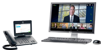
Cisco DX650 IP Endpoint