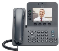
Cisco Unified IP Phone 8945