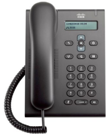
Cisco Unified SIP Phones 3900 Series