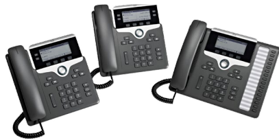
IP Phone 7800 Series

General Business Communications Endpoints