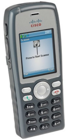
IP Phone 7926G