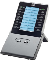
Cisco Unified IP Color Key Expansion Module