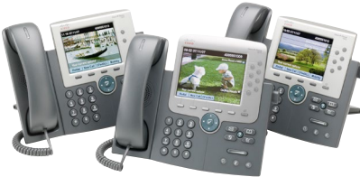
IP Phone 7945G, 7965G and 7975G